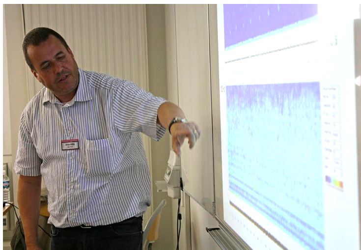
ERMITES Summer School - september 2014 - Toulon