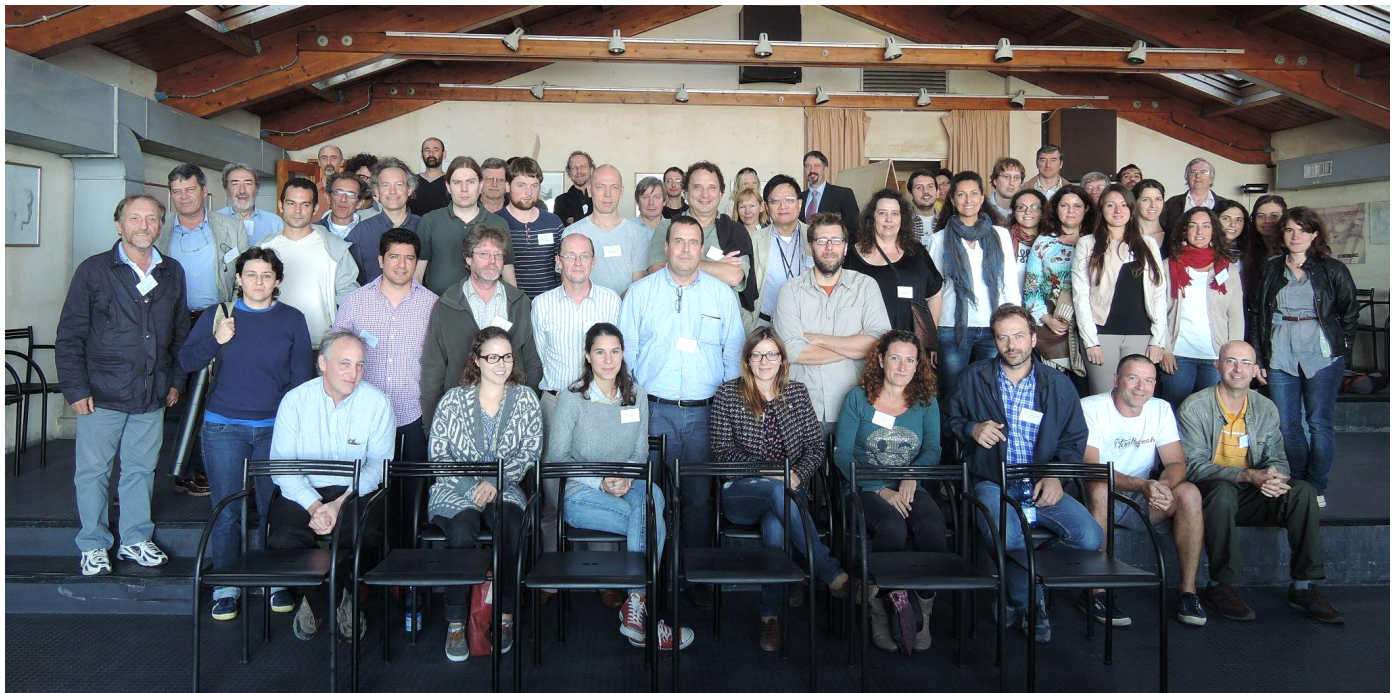
ERICHE 2013, Bioacoustics and Neutrinos, organized by Gianni, Sicilia 2013

http://sabiiod.lis-lab.fr/media/Univ_Toulon_CNRS_BigDataSABIOD_GLOTIN_JASON_PNPC_Chiro3D.mp4