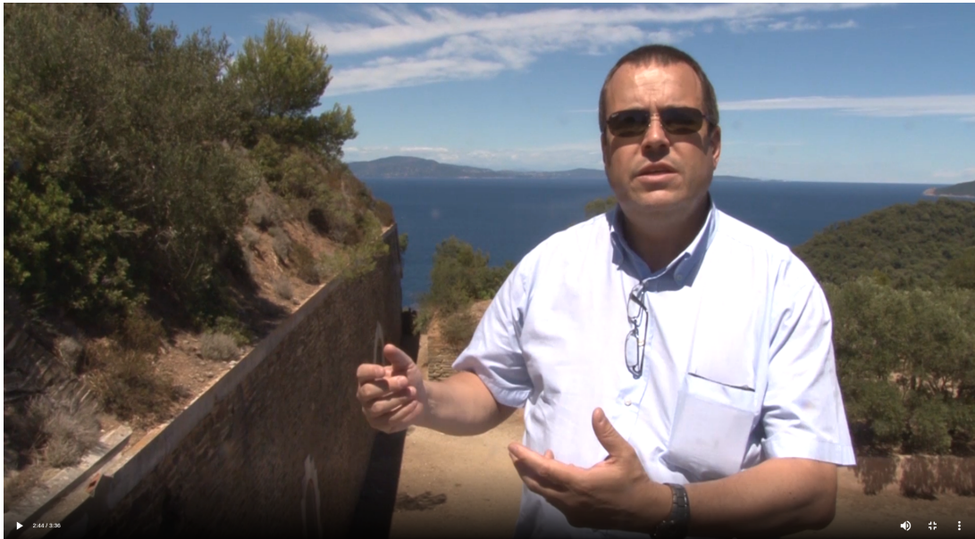
Mission on the field - July 2014 - Toulon Port-Cros

http://sabiiod.lis-lab.fr/media/Univ_Toulon_CNRS_BigDataSABIOD_GLOTIN_JASON_PNPC_Chiro3D.mp4