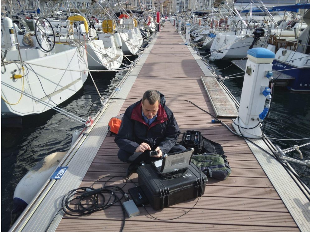
Calibration during Bioacoustics Workshop - March 2023 - Toulon