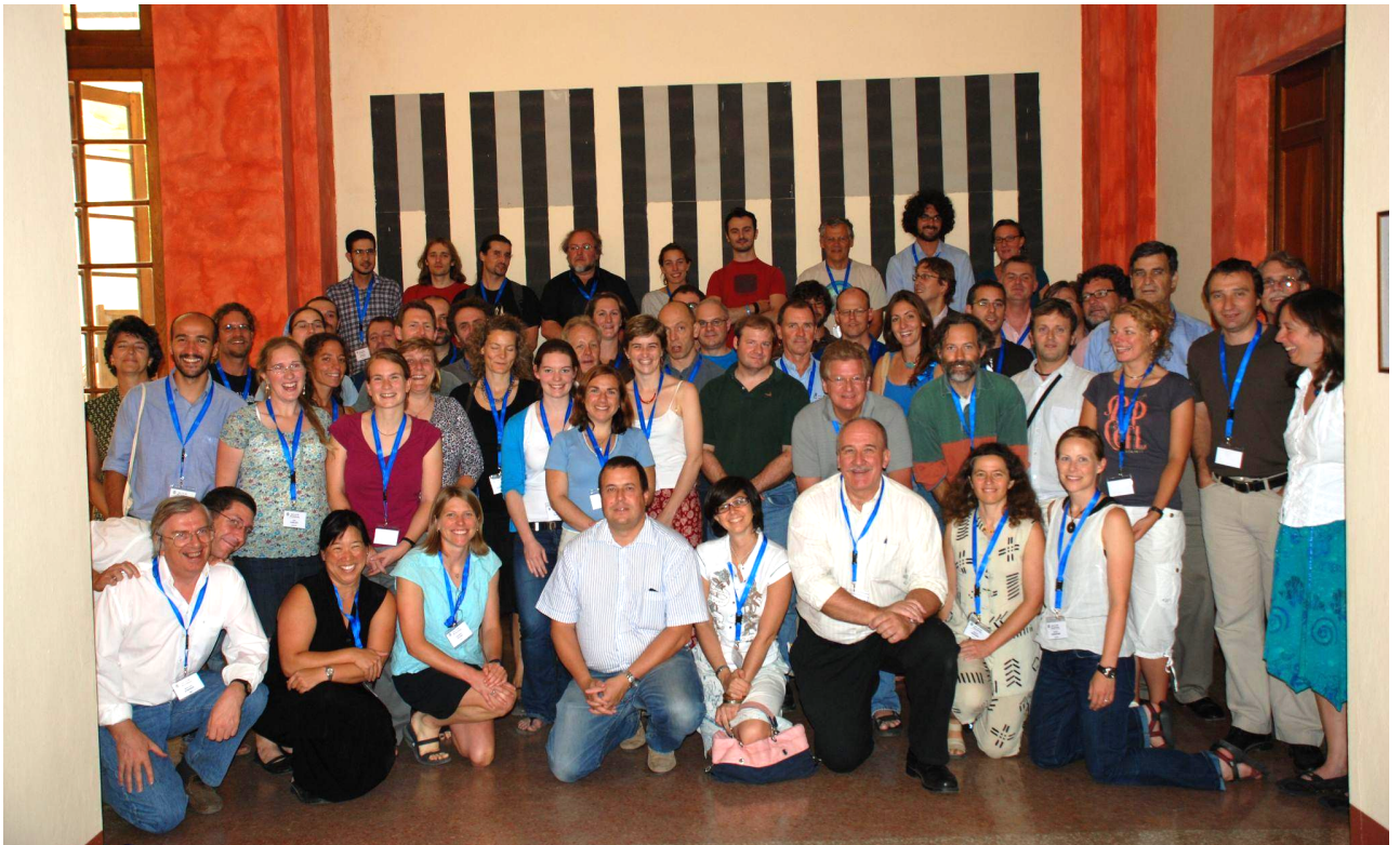
DCLDE Workshop - 2009, organized by Gianni http://www-9.unipv.it/cibra/DCLProceedings2009.html